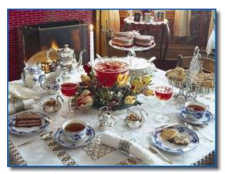
A fully set and decorated tea table